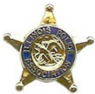
Lapel Pin $5