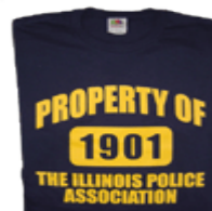
Property of IPA 1901 T-shirts: black, gray, navy blue Call for available Size and pricing