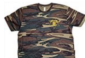
Camouflage T-Shirt with IPA Star Logo Call for available Size and pricing

NOTE: If ordering more than one product please use the reverse side to list each additional item as shown below.