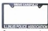
Car or motorcycle license plate holder $5.00