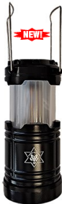
The Illinois Police Association Lantern imprinted with the white IPA Star Logo.

ALL IPA Merchandise is available online @ www.ipastore.com