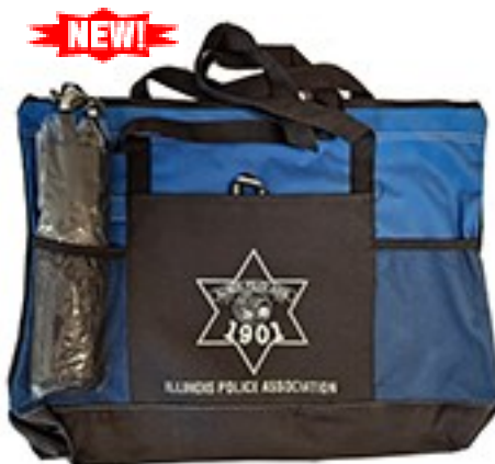
The Illinois Police Association Tote Bag with Umbrella imprinted with the white IPA Star Logo.