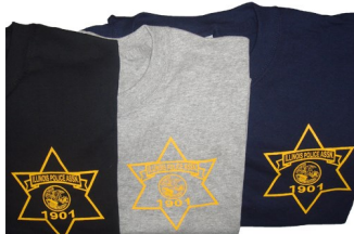
T-Shirts: black and gray Call for available Size and pricing.