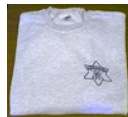
Sweatshirt: grey, navy and black Call for available Size, Color