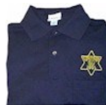
Golf shirts: black, white, and red. Call for available Size and pricing