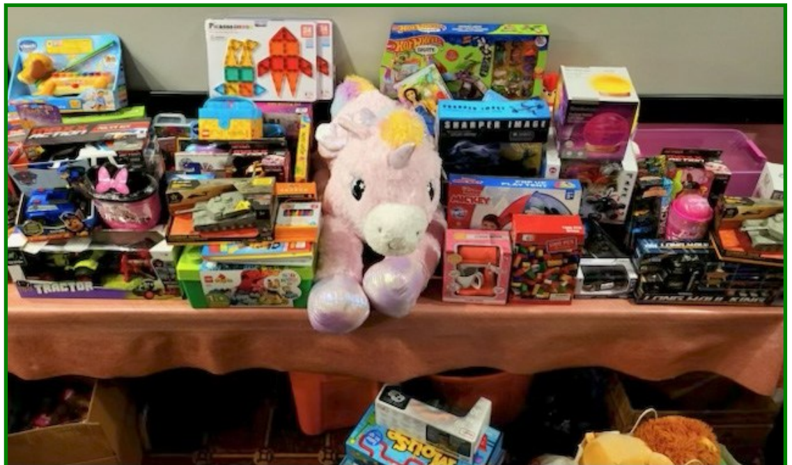
Toys donated at the December meeting of the Tri-County Division