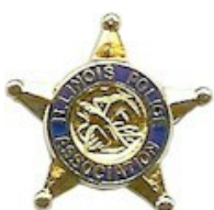
Lapel Pin $5