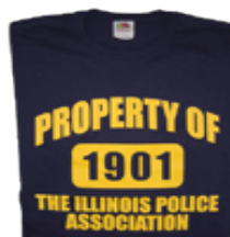
Property of IPA 1901 T-shirts: black, gray, navy blue Call for available Size and pricing