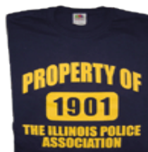
Property of IPA 1901 T-shirts: black, gray, navy blue Call for available Size and pricing