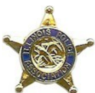
Lapel Pin $5