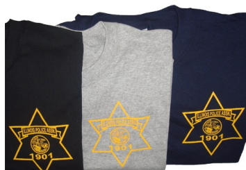
T-Shirts: black and gray Call for available Size and pricing.