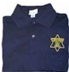
Golf shirts: black, white, and red. Call for available Size and pricing