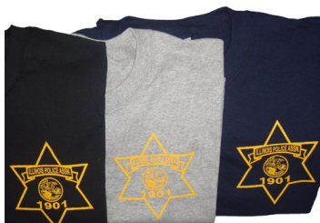
T-Shirts: black and gray Call for available Size and pricing.