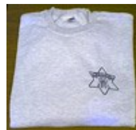
Sweatshirt: grey, navy and black Call for available Size, Color