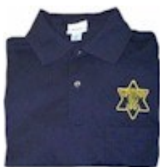
Golf shirts: black, white, and red. Call for available Size and pricing