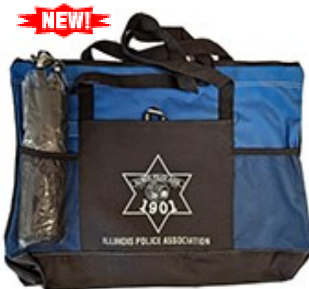
The Illinois Police Association Tote Bag with Umbrella imprinted with the white IPA Star Logo.