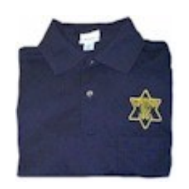
Golf shirts: black, white, and red. Call for available Size and pricing