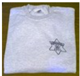
Sweatshirt: grey, navy and black Call for available Size, Color