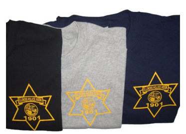
T-Shirts: black and gray Call for available Size and pricing.