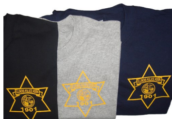
T-Shirts: black and gray Call for available Size and pricing.